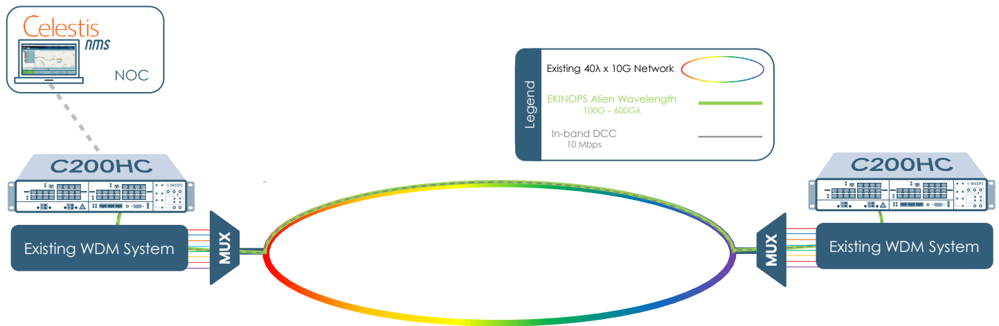
Figure 3 - DCC based management connectivity

Managing your Ekinops360 equipment is easier than installing it. Using Ekinops Celestis NMS network management system, you can provision, monitor and troubleshoot your Ekinops alien wavelength end-to-end from your NOC. Celestis NMS requires only a single DCN connection to the management interface of the near-end shelf using the in-band overhead to carry a 10 Mbps digital communication channel (DCC) to provide far-end management connectivity (see Figure 3).